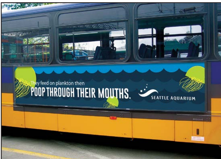
2015 Best Multi-Format Campaign Copacino+Fujikado, Seattle Aquarium "Amazing Facts"