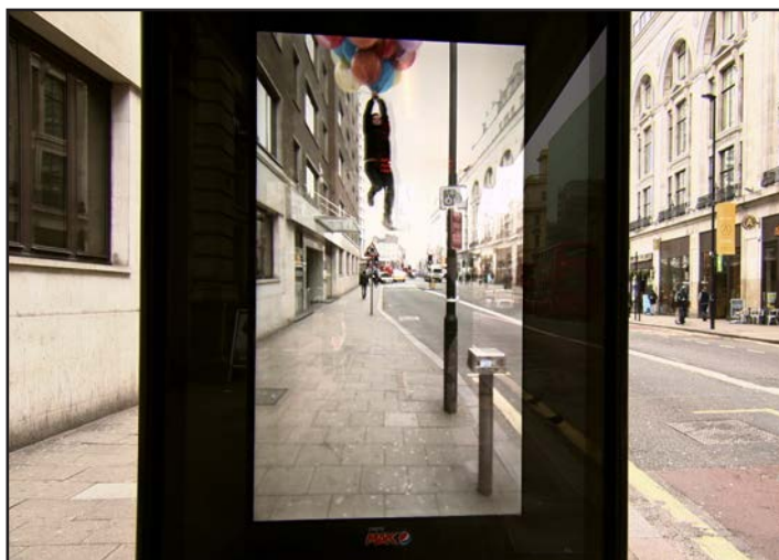
International AMV BBDO & Grand Visual, Pepsi Max "Unbelievable"