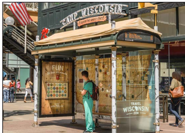
Transportation, Travel & Tourism Laughlin Constable, Wisconsin Department of Tourism "Camp Wisconsin"