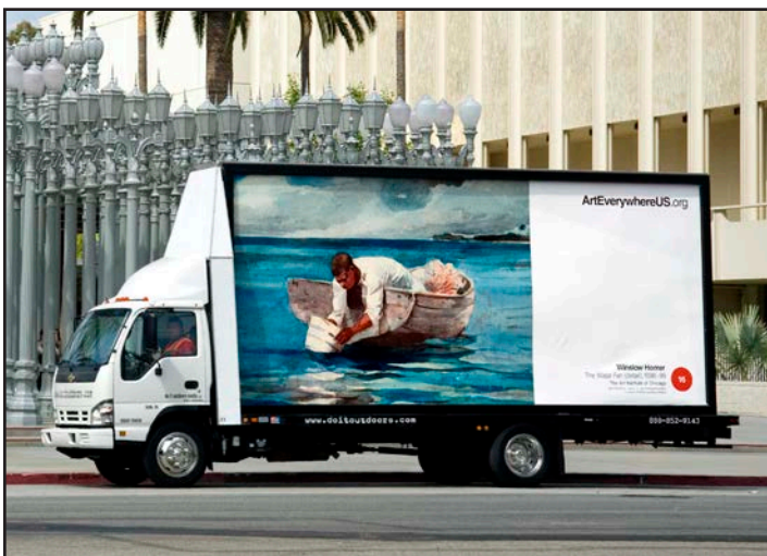
Public Service 101 & Extra Credit Projects, Art Everywhere US