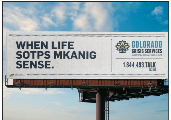
Business & Technology Cactus, Colorado Crisis Services "When You Don't Know Where To Turn"