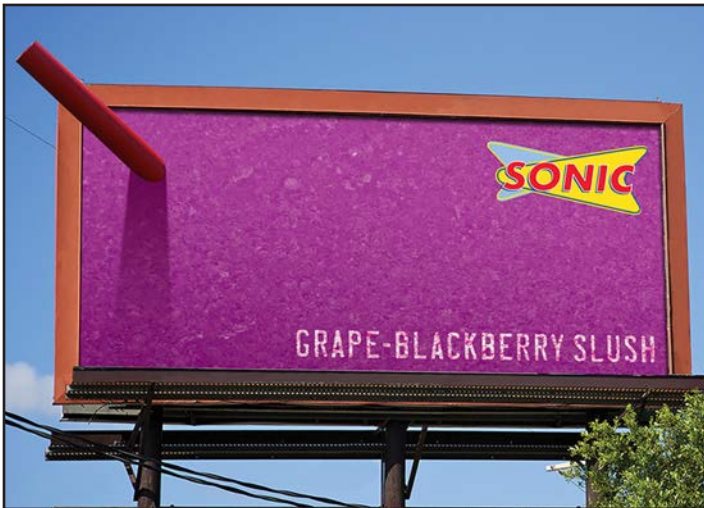
2015 Best Billboard Campaign Adams Outdoor Advertising, Sonic Drive-In "Big Slushes"