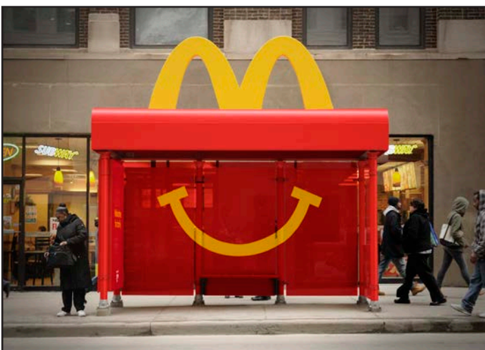
Individual Execution: Street Furniture/Transit/Alternative Leo Burnett Chicago, McDonald's "Happy Meal Bus Shelter"