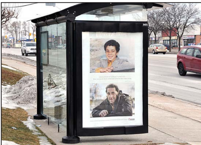
International Leo Burnett Toronto, Raising the Roof "Childhood Photos"