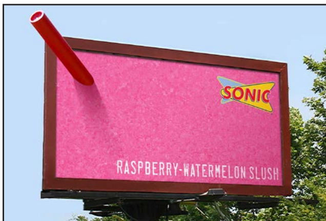
Adams Outdoor Advertising won the 2015 Best Billboard Campaign for Sonic Drive-In’s “Big Slushes,”

Kenneth Cole Productions and Ready Set Rocket were honored with the 2015 Best Street Furniture/Transit/Alternative Campaign award for the OOH launch of Mankind by Kenneth Cole Fragrances. The campaign showcased the ability of OOH media to drive mobile activity using subway advertisements to challenge men to “be the evolution” by participating in a 21-day