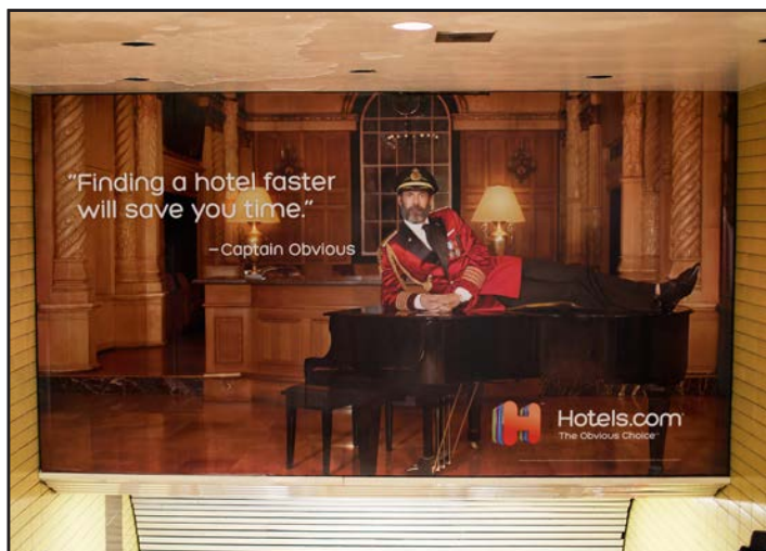
International CP+B, Hotels.com "The Obvious Choice" Toronto Dundas Train Station Domination