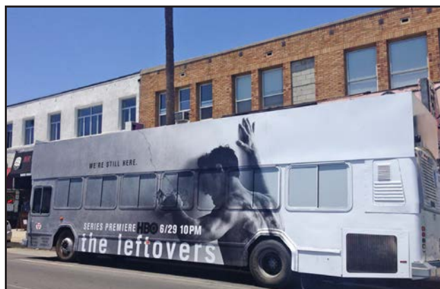
Iconic brand HBO won the 2015 OBIE Hall of Fame Award.

good deed challenge. Participants were encouraged to share their good works through social media using #manupformankind.