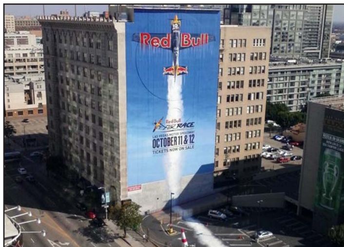
Individual Execution: Billboard Kastner & Partners, Red Bull Air Race "Vertical Loop"