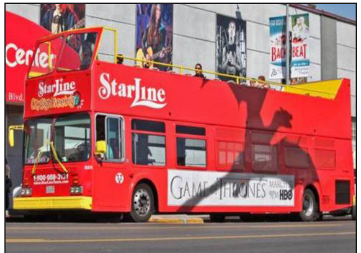
2015 Hall of Fame HBO