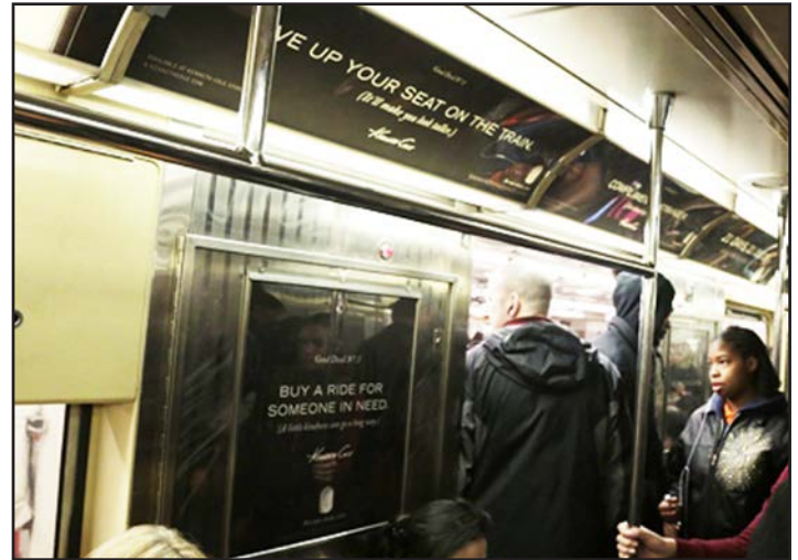
2015 Best Street Furniture/Transit/Alternative Campaign Kenneth Cole Productions & Ready Set Rocket Mankind by Kenneth Cole "Be the Evolution"